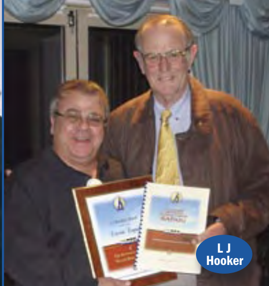
L J Hooker