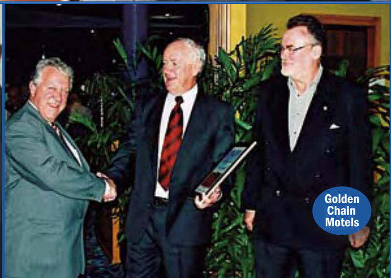
Golden Chain Motels