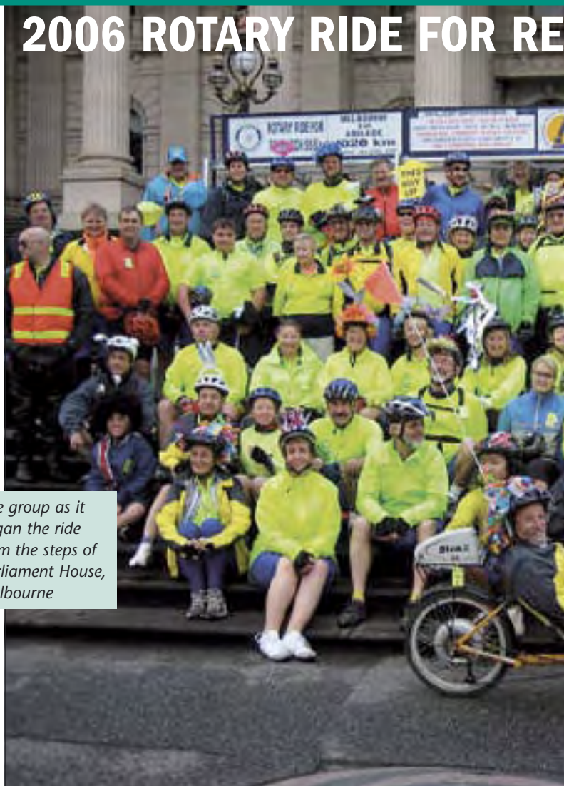
The group as it began the ride from the steps of Parliament House, Melbourne