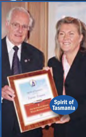
Spirit of Tasmania