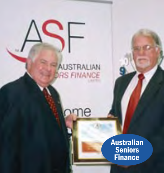
Australian Seniors Finance